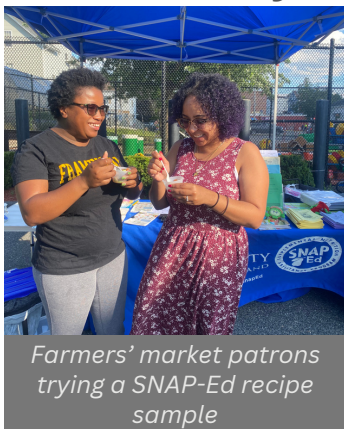
Farmers' market patrons trying a SNAP-Ed recipe sample

Learning about adults' food practices and suggesting additional ideas on how to plan, buy, and prepare healthy meals they enjoy on a budget.