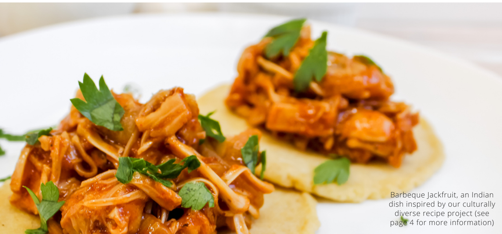
Barbeque Jackfruit, an Indian dish inspired by our culturally diverse recipe project (see page 4 for more information)

SUPPLEMENTAL NUTRITION ASSISTANCE PROGRAM-EDUCATION (SNAP-ED)