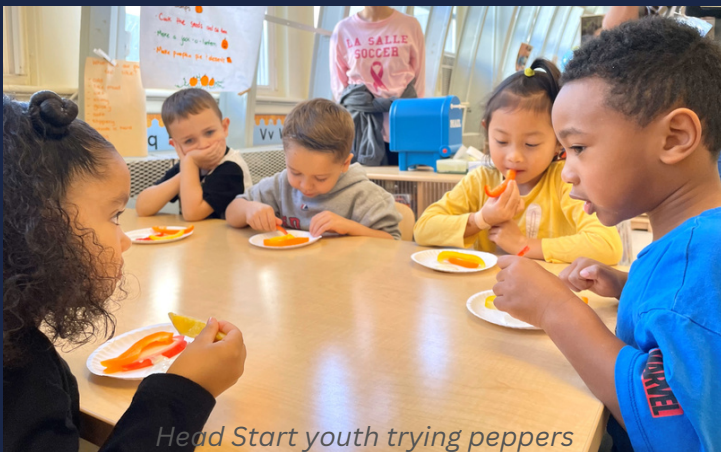
Head Start youth trying peppers

“Honestly, I only eat my mom’s pasta at home because there’s a very specific way that I like it...but I think I want another plate of this lasagna. It’s so amazing and I wouldn’t have tried it like this...This is weird but tastes amazing!” Afterschool youth participant