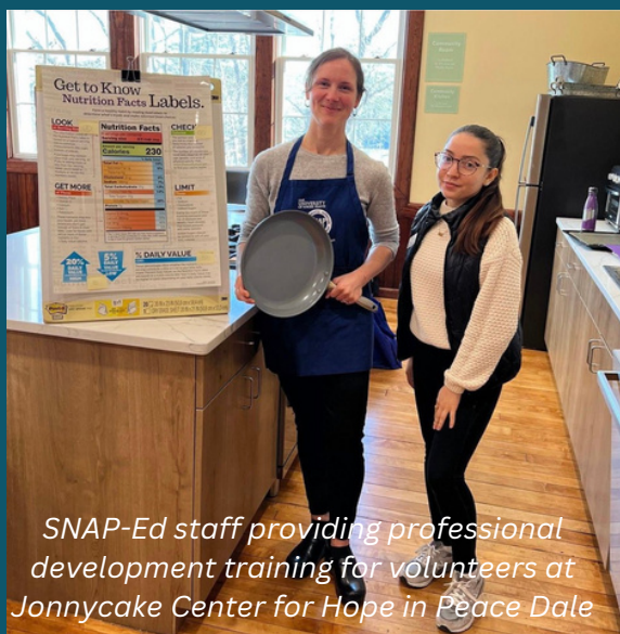
SNAP-Ed staff providing professional development training for volunteers at Jonnycake Center for Hope in Peace Dale

The PSE efforts complemented the hands-on workshops and table events with clients to encourage positive nutrition behaviors. Workshops focused on MyPlate and the five food groups, fruits and vegetables, whole grains, healthy beverages, and food resource management practices. One workshop client stated, "Nutrition Labels are a must for me to read now. I eat way more beans to increase my fiber intake."