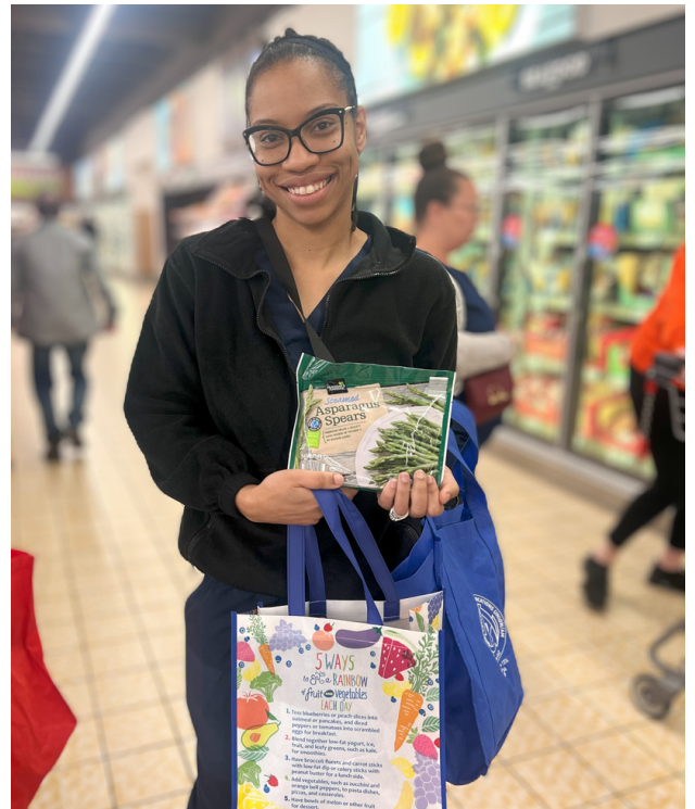
Parent from a family series joining a grocery store tour to learn nutrition and money saving tips

In addition, food advertisements and marketing towards youth sway their purchases of energy-dense snacks and sugar-sweetened beverages with 38% of youth's daily diet consisting of these foods (3).