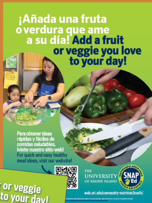
Bilingual sample social media post, sample postcard, and bilingual poster